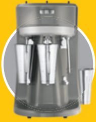
Triple-Spindle Drink Mixer HMD400 Series