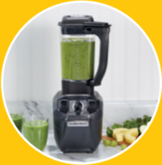
The Tango® Blender HBH455 Series