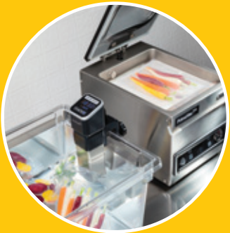
AcuVide™ 1000 Immersion Circulator HSV1000 Series