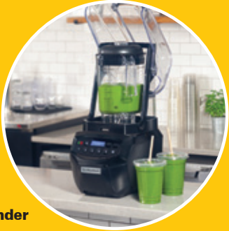
Summit Edge® Blender HBH855 Series