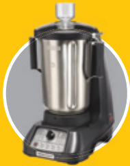
EXPEDITOR™ 1100S Culinary Blender HBF1100S Series