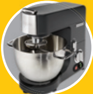
8L Stand Mixer CPM800 Series