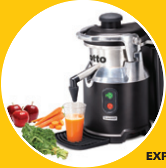
otto™ the Juice Extractor HJE960 Series

The Choice of Restaurant and Hotel Chains Worldwide.