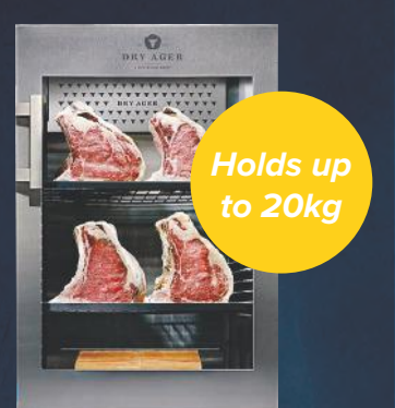
Dry Ager DX1000 Meat Maturing Fridge EVF1

Dry Ager DX500 Meat Maturing Fridge EVF2