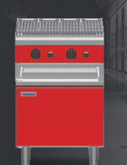
Waldorf FNLB8127E Electric Fryer Bold Chilli Red

Waldorf CHLB8600G-D Gas Chargrill Bold Chilli Red