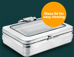
BSF15 Induction Chafer 1/1GN 7.5Ltr