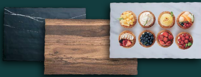
HMF11 Board 430x290x9mm Marble Jet HMF12 Board 430x290x9mm Acacia HMF10 Board 430x290x9mm Marble White