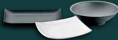
HMJ8 Rectangle Frosted Platter 22.6cm Black HMJ1 Square Curved Platter 35cm White HMJ27 Wide Bowl 34cm Black