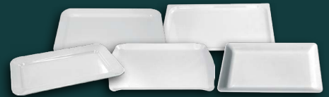
HMG30 Platter Rectangle 45x31cm White HMG7 Platter Rectangle 53x32cm White HMG23 Rectangle Platter 37x21cm White HMG4 Tray 43x29cm White HMG17 Tray Rectangle 31x20cm White