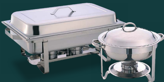
BSL1 Economy Rectangle Chafing Dish

Budget: cost-effective way to create visually appealing displays without breaking the bank