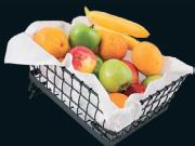
HTC67 Basket Metal Wire 330 x 250 x 125mm