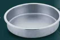
BSF12 Food Pans S/Steel for Round Chafer