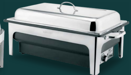
HLT23 Electric Chafer 1/1GN with Flat lid, 13.5Lt

Budget: cost-effective way to create visually appealing displays without breaking the bank