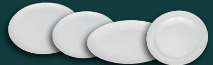
HMG24 Plate Round 38cm White HMG19 Plate Round 33cm White HMG1 Platter Oval 40cm White HMG33 Platter Round 47cm White