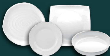
HMJ7 Swirl Round Plate 40.6cm White HMJ42 Plate 23cm White HMJ2 Square Curved Platter 45cm White HMJ15 Round High Sided Meal Plate 23cm White