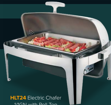
HLT24 Electric Chafer 1/1GN with Roll Top lid, 13Lt