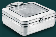
BSF9 Induction Chafer 2/3GN 6.5L