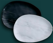
HMF2 Egg-shape Platter 41x31cm Black HMF1 Egg-shape Platter 41x31cm White