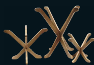
HTC105 Fold-A-Way Riser Set of 3 Acacia