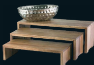
HTC101 Cascade Riser Set of 3 Acacia