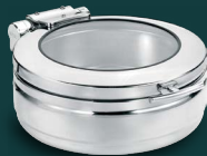
BSF8 Induction Chafer Round 6.5L