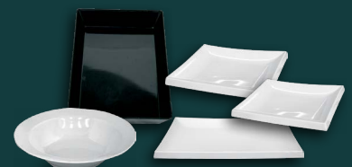
HMG9 Bowl Round 38cm White HMG29 Bowl Rectangle 45x30x7cm Black HMG26 Rectangle Platter 36x20cm White HMG25 Rectangle Platter 24x20cm White HMG27 Platter Rectangle 40x27cm White