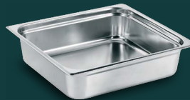
BSF13 Food Pans S/Steel for 2/3GN Chafer