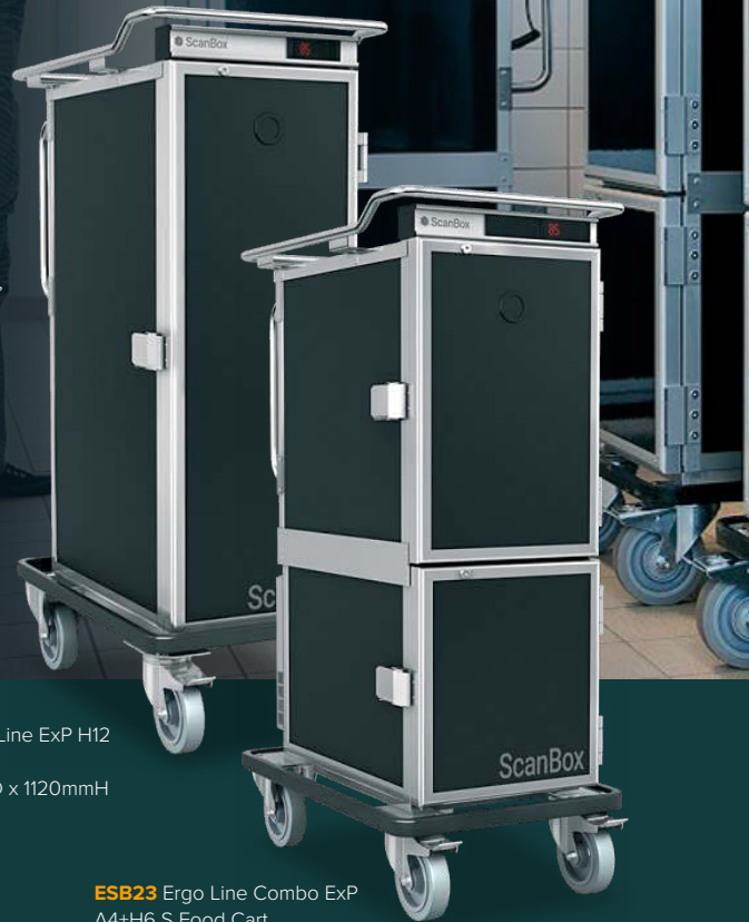
ESB18 Ergo Line Exp H12 F Food Cart 540W x 810D x 1120mmH

Reduce labour costs by allowing staff to make fewer trips and deliver multiple meals at once, reducing the risk of spills or dropped dishes.