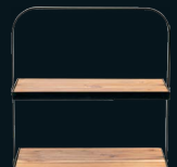
HTC112 Rectangular Two-Tiered Acacia Display Stand 200mm x 445mm x 460mm