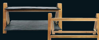
HTC103 Folding Riser Frame 2-Tier Acacia 584mm • HTC104 Folding Riser Frame 2-Tier Acacia 381mm