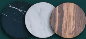
HMF14 Round Platter 350x30mm Marble Jet HMF13 Round Platter 350x30mm Marble White HMF18 Round Platter 440x30mm Acacia