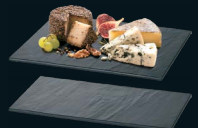
HTC39 Melamine Slate Platter 26.7 x 32.4 • HTC53 Melamine Slate Platter 17.2 x 32.4