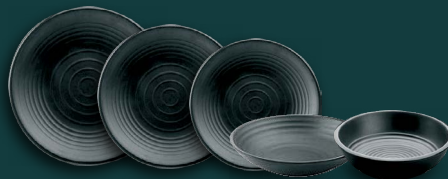
HMJ23 Swirl Round Plate 40cm Black HMJ22 Swirl Round Plate 32cm Black HMJ21 Swirl Round Plate 27cm Black HMJ16 Swirl Shallow Round Bowl 10cm Black HMJ30 Swirl Deep Plate 36.6cm Black