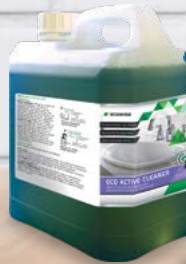
Active Cleaner 2 Litre HCK426