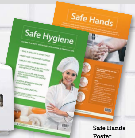
Safe Hygiene Poster HSD3