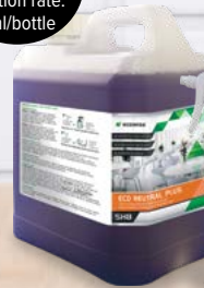
SH8 Neutral Plus 2 Litre HCK443

Makes 250 x 750ml bottles. Dilution rate: 8ml/bottle