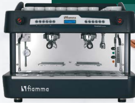
Quadrant 2 DSP Volumetric Espresso Machine EF22