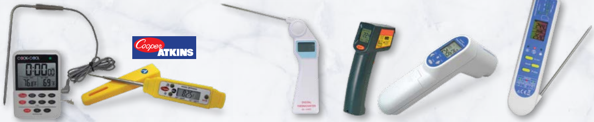
A. Digital Cooking Thermometer with Probe (HTA16) B. Mini Digital Thermometer (HTA15) C. Thermometer with Folding Probe (HTR06) D. Non-contact Infrared Thermometer (HTR2) E. Infrared Thermometer (HTR3) F. Infrared Thermometer with Thermocouple (HTR1)

Cook food to a safe temperature. Make sure your thermometer is calibrated to ensure you meet the required temperature accuracy.