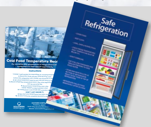
A. Stainless Steel Fridge/Freezer Thermometer (HTA4) B. Magnetic Refrigeration Thermometer (HTA11) C. Fridge/Freezer Thermometer (HL17) D. Cold Food Temperature Records Pad (DSP1) E. Safe Refrigeration Poster (HSD7)