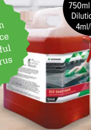
SH4 Sanitiser 2 Litre HCK445

Clean and sanitise kitchen surfaces to a high standard to reduce the risk of harmful bacteria and virus spreading