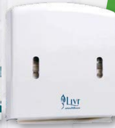
Dispenser for Slimfold Paper Towels DC706