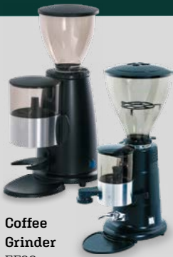
Coffee Grinder EF26