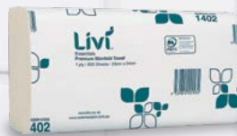
Slimfold 1 Ply Paper Towel DC101 • 200 sheets