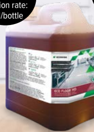
Heavy Duty Floor Cleaner 2 Litre HCK425

Makes 250 x 750ml bottles. Dilution rate: 8ml/bottle