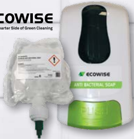
1 Litre Antibacterial Soap HCK456