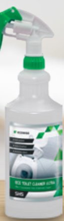
750ml Bottle with Spray Head HCK454