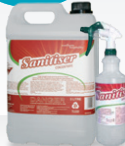
5L Sanitiser HCK71

Sanitises food premises: floors, walls & machines