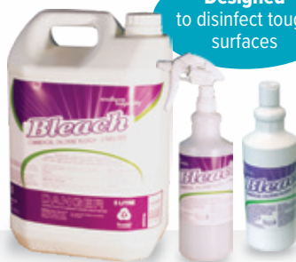
5L Bleach Application Bottle Application Bottle with Flip Cap HCK20 HCK17 HCK19

General cleaner removes: vegetable & animal fats, kitchen grease & grime