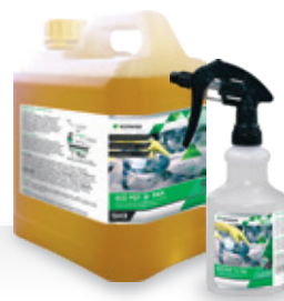
SH3 Pot & Pan Ultra Concentrate 2L HCK442 500ml Bottle HCK429