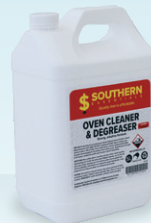
Essentials 5 Litre Degreaser and Oven Cleaner HCO6