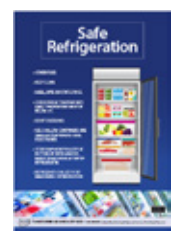
Safe Refrigeration Poster HSD7