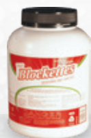
4kg Toilet Blockettes HCK99