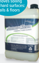
5L Ammo-Clean HCK11

Cleaner removes soiling from hard surfaces: walls & floors