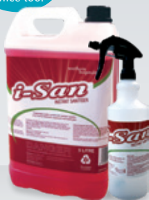
5L i-San HCK60