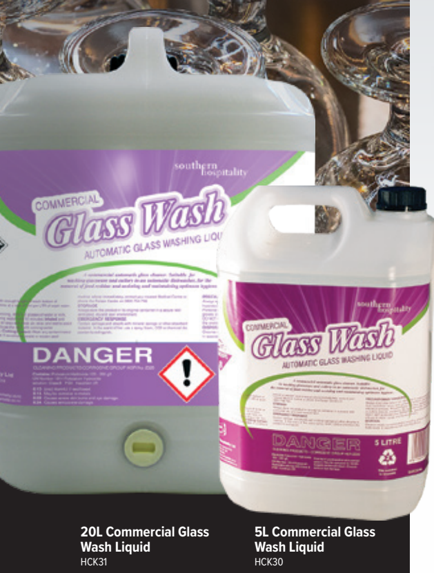
20L Commercial Glass Wash Liquid HCK31

Formulated to clean and sanitise glass and cutlery in one easy step.