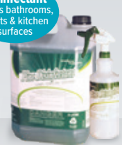
5L Pine Disinfectant Application Bottle HCK62 HCK37

Disinfectant cleans bathrooms, toilets & kitchen surfaces