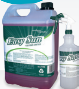
5L Easy San HCK79

Food surface sanitiser and soak disinfectant