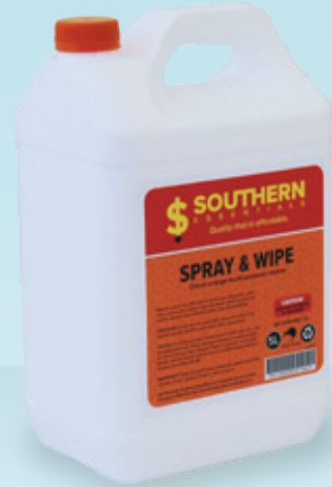
Essentials 5 Litre Spray n Wipe HCO4