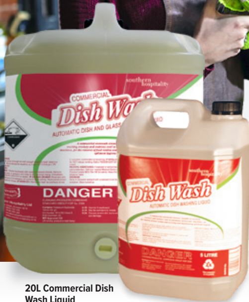
20L Commercial Dish Wash Liquid HCK28