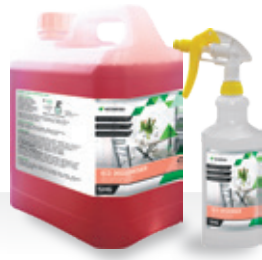
SH6 Deodoriser Ultra Concentrate 2L HCK451 750ml Bottle HCK436