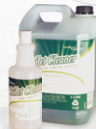
Application Bottle HCK15