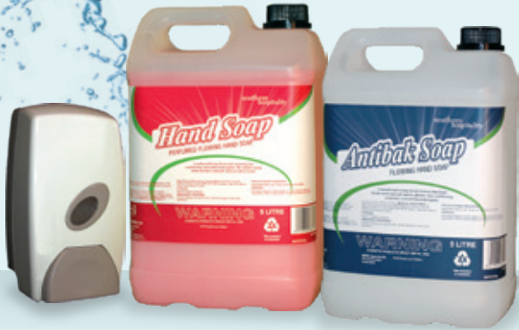
Hand Soap/Sanitiser Dispenser HCK42