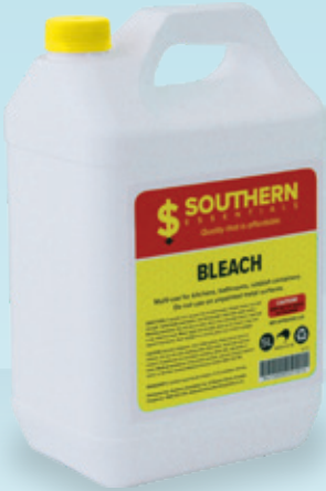
Essentials 5 Litre Bleach HCO1