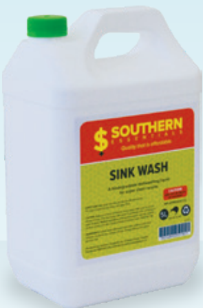
Essentials 5 Litre Sink Wash HCO2