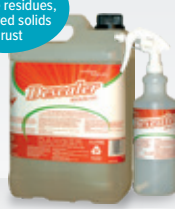
5L Descaler Application Bottle HCK38 HCK80

Removes alkaline residues, dissolved solids & rust