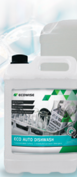
5L Commercial Auto Dishwash HCK437