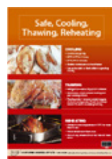
Safe Cooling, Thawing, Reheating Poster HSD4