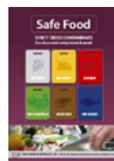
Safe Food Poster HSD1