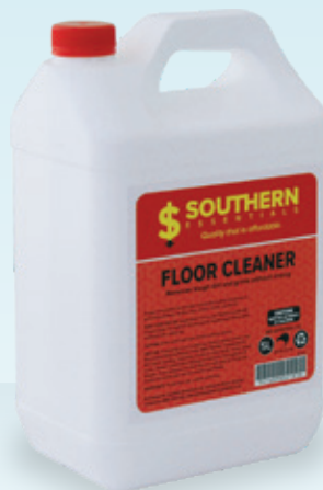
Essentials 5 Litre Floor Cleaner HCO3