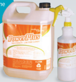
5L PowerPlus HCK67

Detergent high strength used for cleaning beerline systems, grill & hotplate areas