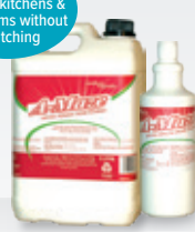
5L A-Maze 1L A-Maze HCK13 HCK12

Cleaner used in kitchens & bathrooms without scratching