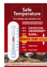
Safe Temperature Poster HSD6