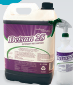
5L Detsan 25 HCK48