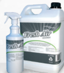
Application Bottle HCK82