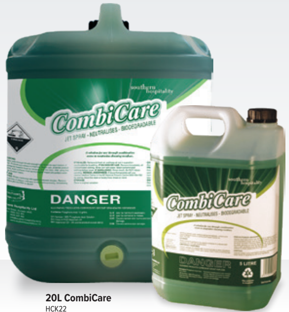
20L CombiCare HCK22