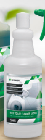
1L Bottle Press Cap HCK453