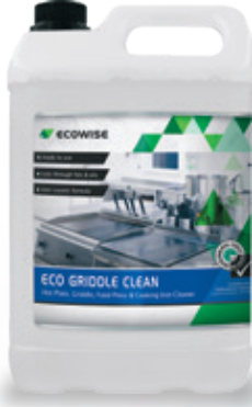
5L Griddle Clean HCK447

Scan here to see the griddle clean in action.