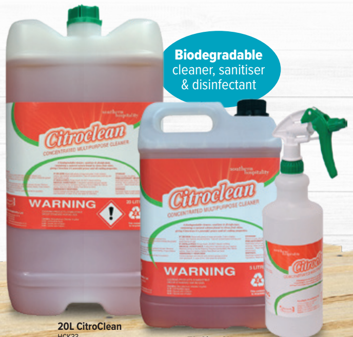
Application Bottle HCK23

Biodegradable cleaner, sanitiser & disinfectant