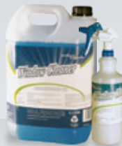
5L Window Cleaner Application Bottle HCK332 HCK331

Floor cleaner for cleaning fats, oils & grease