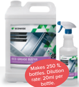
5L Grease Buster HCK446 1L Bottle HCK453

Makes 250 1L bottles. Dilution rate: 20ml per bottle.