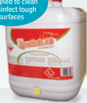
20L Sodium Hypochlorite 14% HCK59

A Chlorine Bleach designed to clean & disinfect tough surfaces