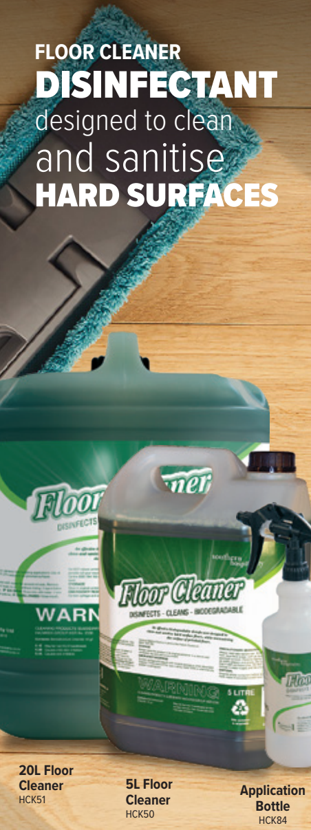
20L Floor Cleaner HCK51