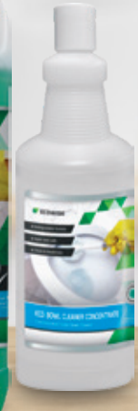
1L Bottle Press Cap HCK435