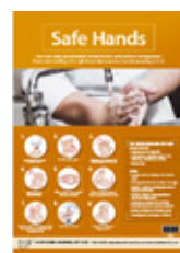
Safe Hands Poster HSD2