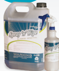
5L Spray n Wipe HCK95

An absolute must for foodservice establishments