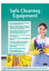
Safe Cleaning Equipment HSD5

To boost staff awareness about food safety, just pop up some handy posters in the kitchen and bathrooms.