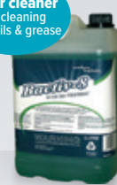
5L Bactiv-8 HCK14

Floor cleaner for cleaning fats, oils & grease