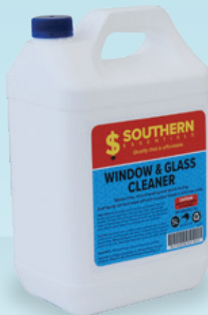
Essentials 5 Litre Window and Glass Cleaner HCO5