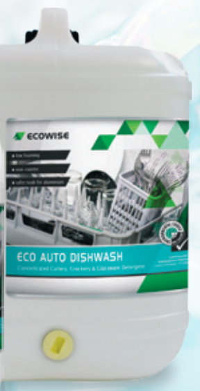
20L Commercial Auto Dishwash HCK438