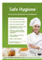
Safe Hygiene Poster HSD3