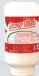
4.5kg Power Wash HCK68

Food surface sanitiser and soak disinfectant