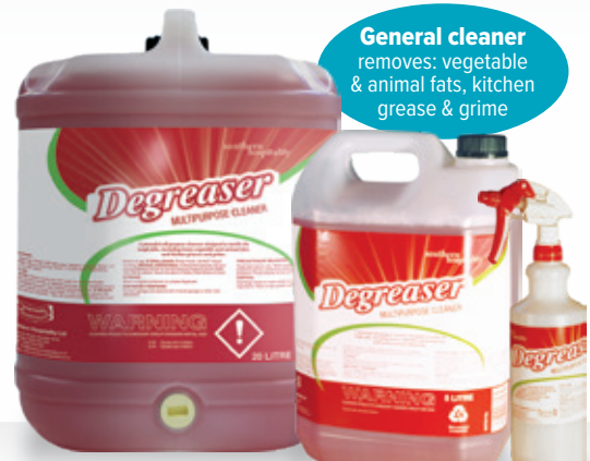
20L Degreaser 5L Degreaser Application Bottle HCK41 HCK40 HCK39

General cleaner removes: vegetable & animal fats, kitchen grease & grime