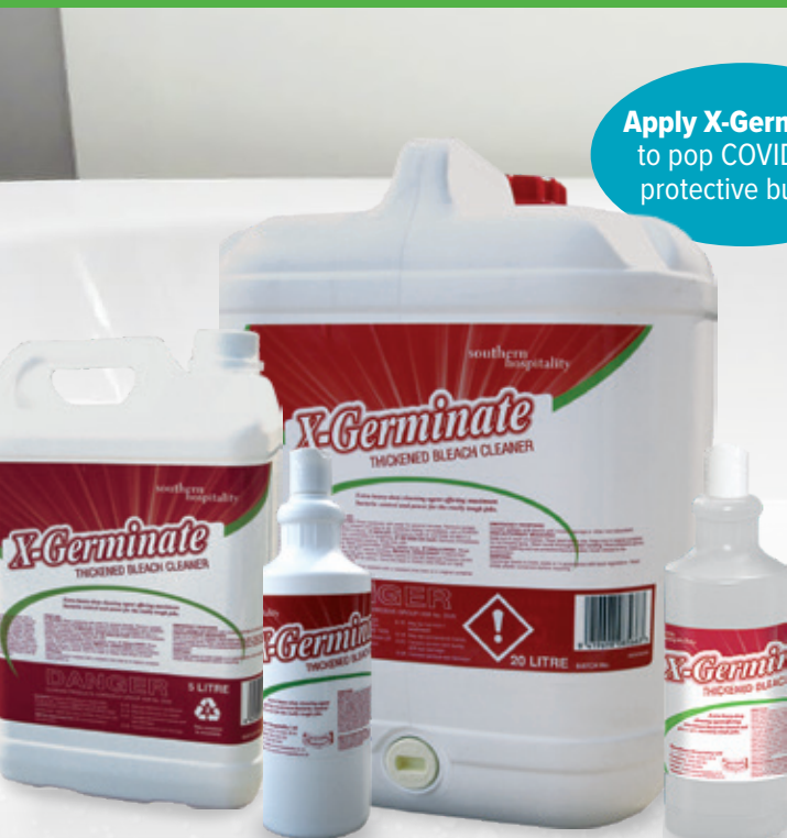
5L X-Germinate HCK73

Apply X-Germinate to pop COVID-19's protective bubble