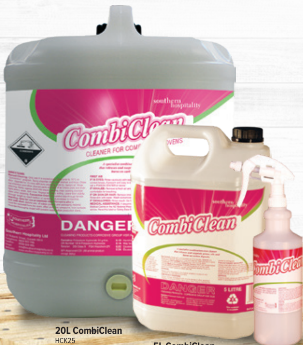
20L CombiClean HCK25