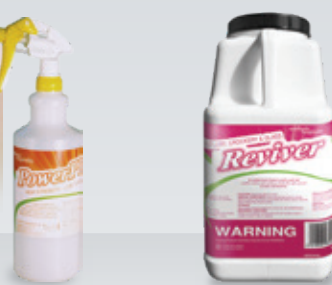
4.5kg Crockery/Cutlery Reviver HCK26