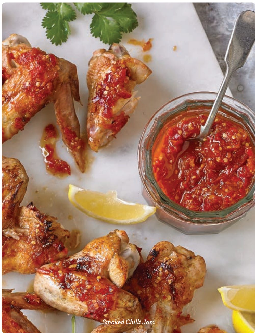
Smoked Chilli Jam