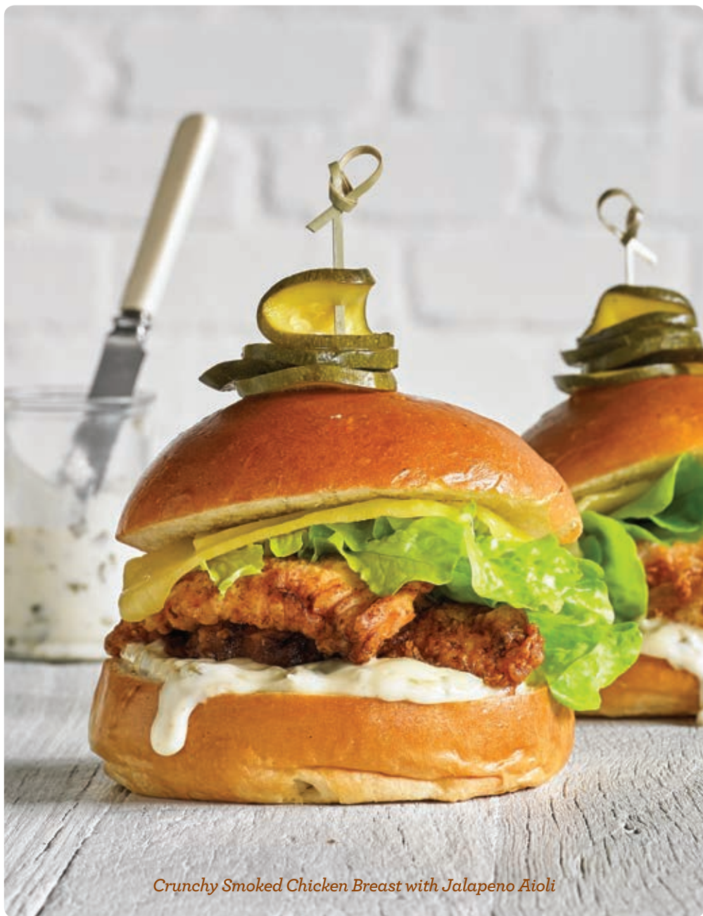
Crunchy Smoked Chicken Breast with Jalapeno Aioli