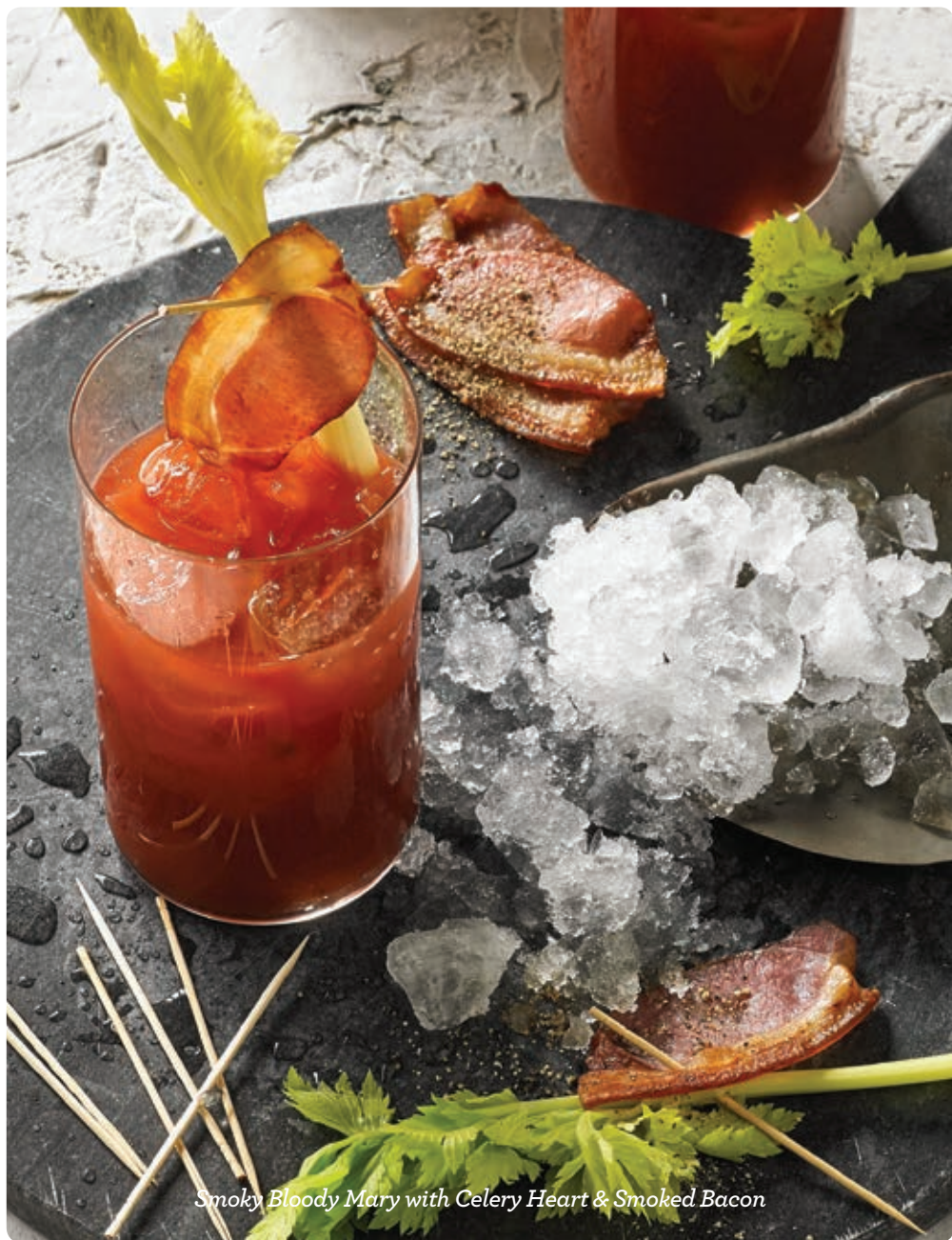
Smoky Bloody Mary with Celery Heart & Smoked Bacon