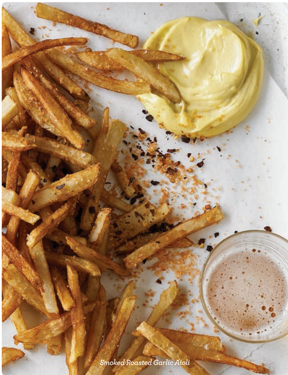
Smoked Roasted Garlic Aioli