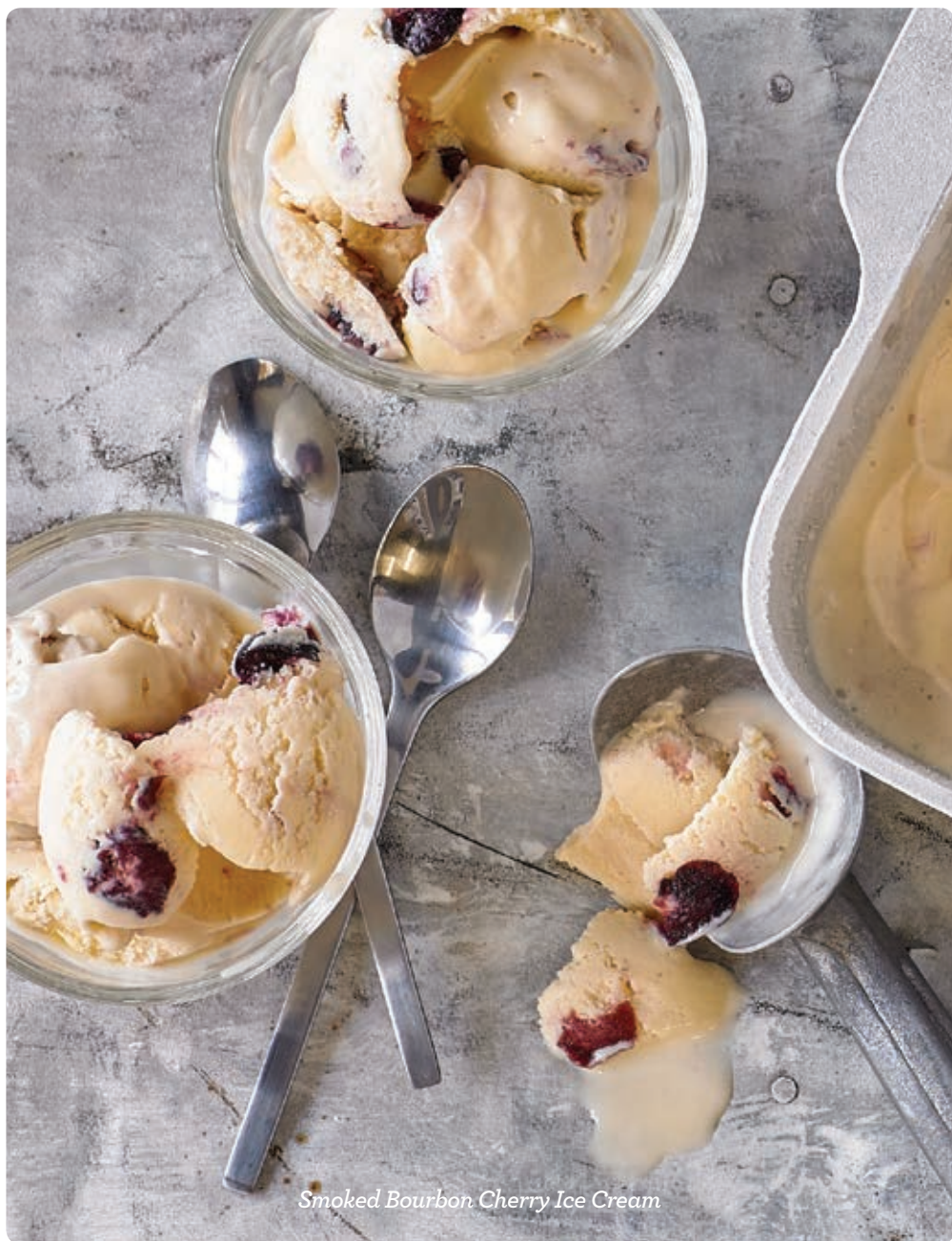
Smoked Bourbon Cherry Ice Cream