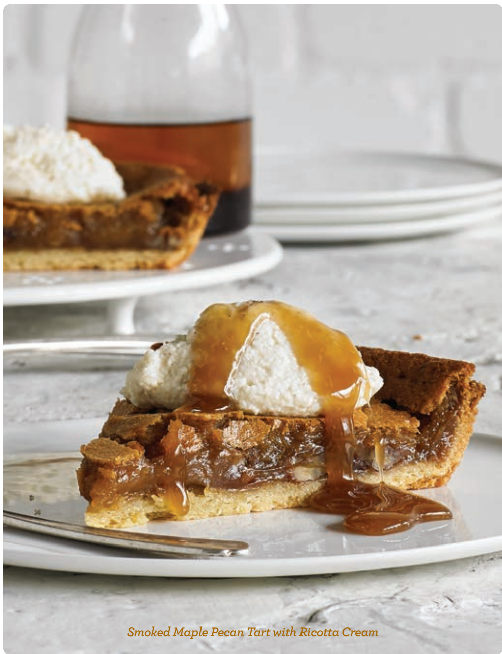
Smoked Maple Pecan Tart with Ricotta Cream