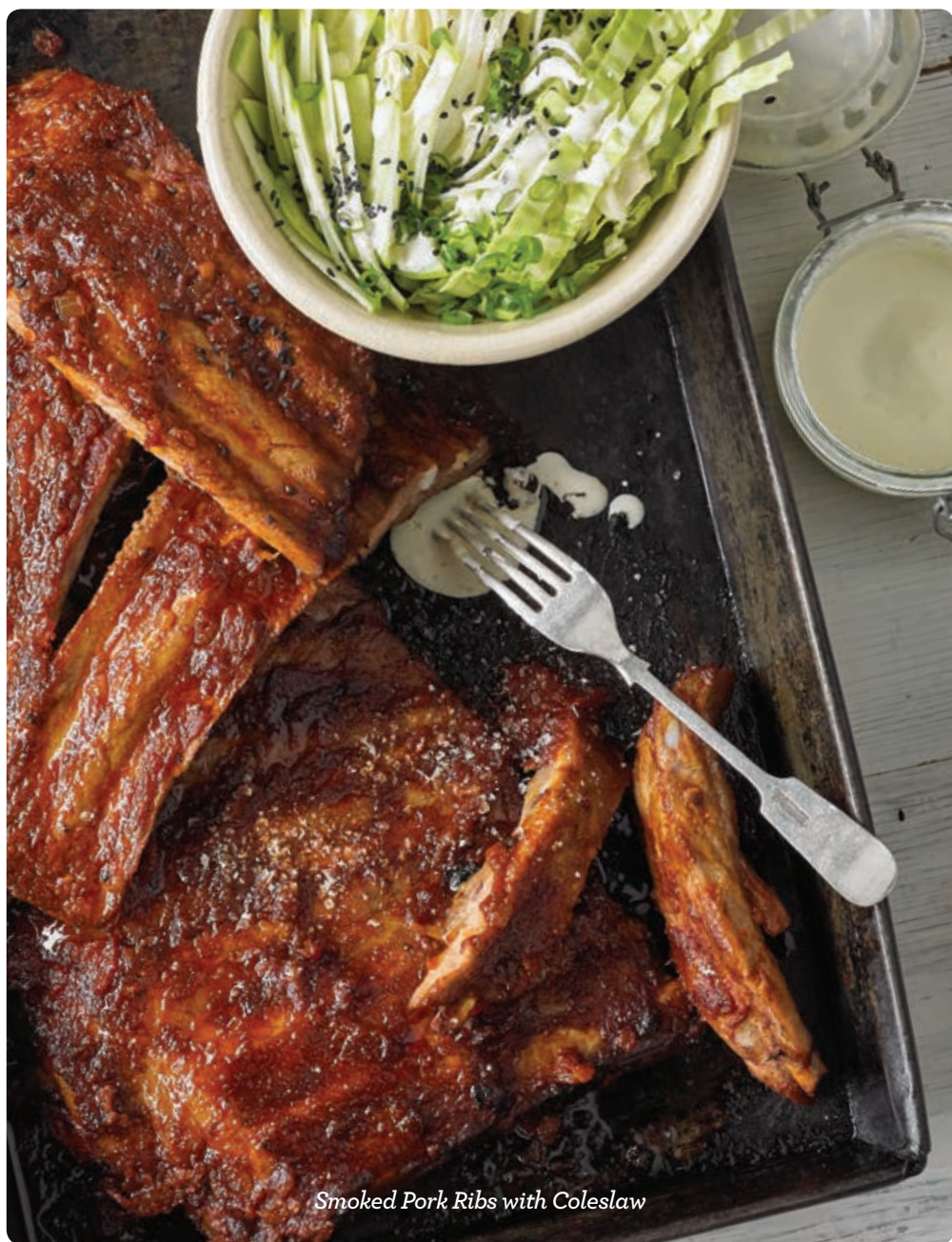
Smoked Pork Ribs with Coleslaw