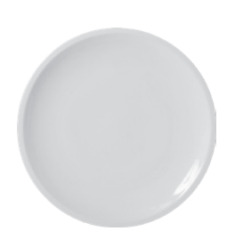
CLASSIC PIZZA PLATE Code Size Ctn/Qty CA112 32cm 12