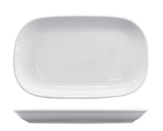
CLASSIC RECTANGULAR PLATTER Code Size Ctn/Or CA125 21.5 x 13.5cm 24 CA126 26.5 x 17cm 24