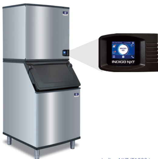
Indigo NXT iT1200 ice machine on a D570C bin

Designed for operators who know that ice is critical to their business, the Indigo NXT Series ice machine's preventative diagnostics continually monitor itself for reliable ice production. Improvements in cleanability and programmability make your ice machine easy to own and less expensive to operate.