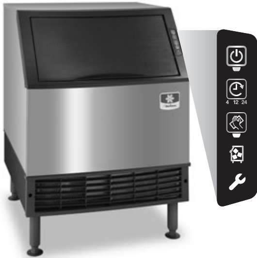
U-310 Undercounter Ice Machine