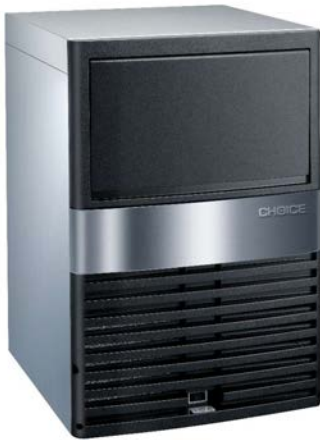
H70A Ice Machine