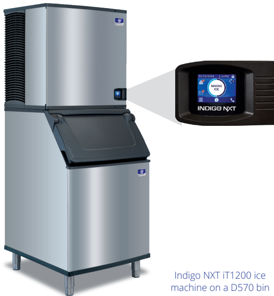
Indigo NXT iT1200 ice machine on a D570 bin

Designed for operators who know that ice is critical to their business, the Indigo NXT Series ice machine's preventative diagnostics continually monitor itself for reliable ice production. Improvements in cleanability and programmability make your ice machine easy to own and less expensive to operate.