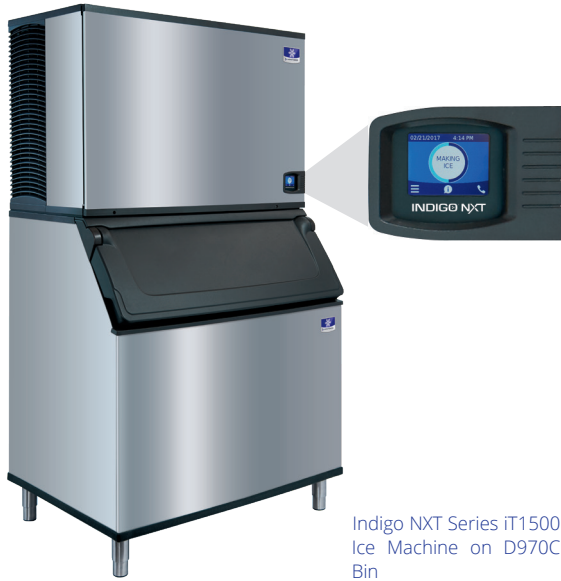
Indigo NXT Series iT1500 Ice Machine on D970C Bin

Designed for operators who know that ice is critical to their business, the Indigo NXT Series ice machine's preventative diagnostics continually monitor itself for reliable ice production. Improvements in cleanability and programmability make your ice machine easy to own and less expensive to operate.