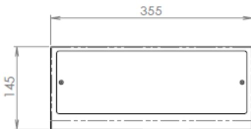
MODEL FCP Plan

When specifying this product please include: