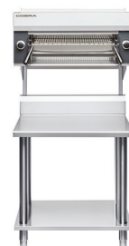
CS9 / C900-S