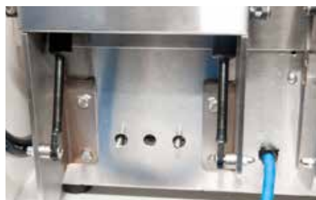
Twin thermostat controls on rear of unit