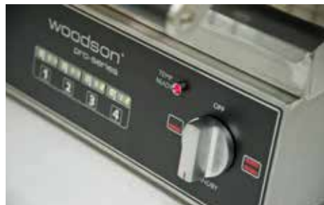
New energy saving plate selection control

Used in quick service restaurants around the globe, these are the true professionals' choice.