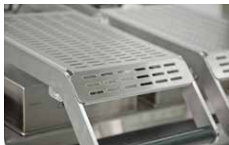
Protective heat shield and rigid handle