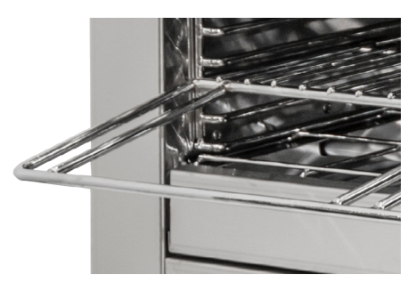
Chrome plated toasting rack

The Woodson Supertoast is essential to get that perfect toast on all your open snacks. The Supertoast is an efficient, dependable, and cost effective unit that completes any commercial kitchen.