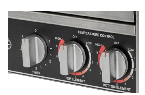
Top and bottom temperature or timer operational control