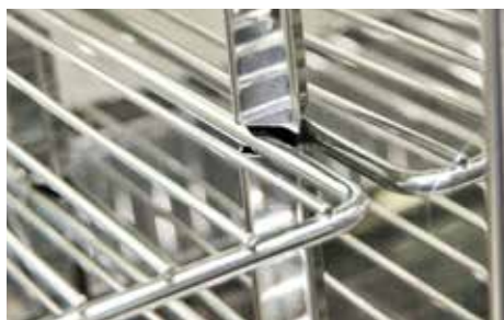
Easily removable display racks