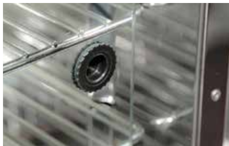
Toughened glass sliding doors

Woodson pie/food displays ensure pre-cooked food is held at a proper serving temperature whilst being displayed to enhance optimum sales.