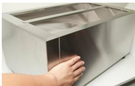
Cool-to-touch safety feature during operation