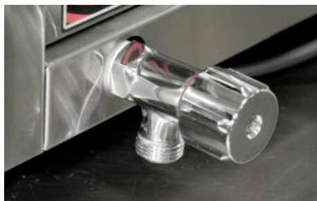
Large 20mm drain