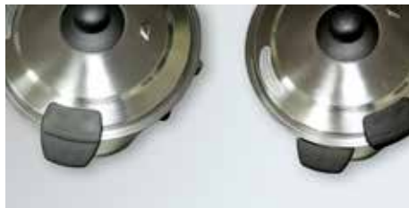
Lockable lid for added safety