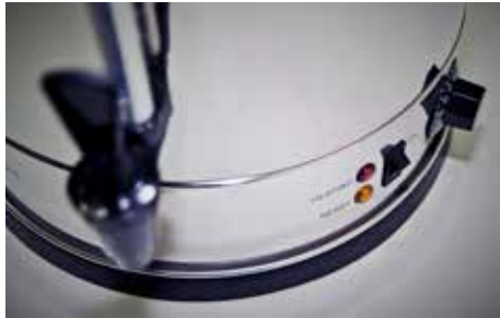
Indicator lights for practicality

Available in 3 sizes for whichever event you're organising.