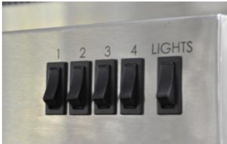
Multiple speed fan selection