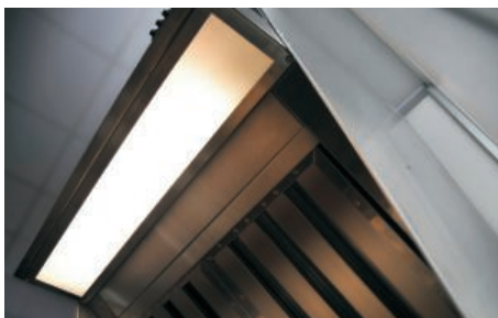
Includes fluorescent lighting