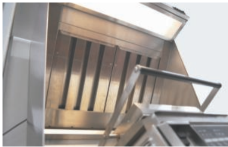
Designed for use over benchtop equipment