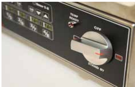
New energy saving plate selection control