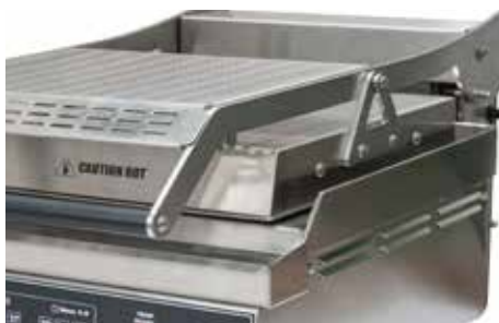
Protective heat shield