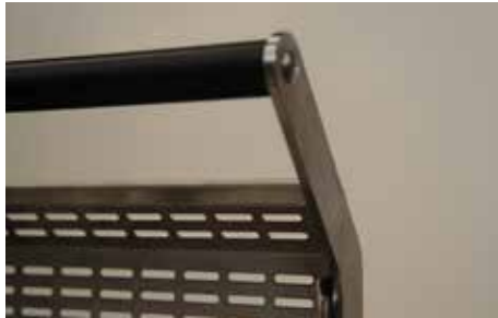
Rigid, heat protective handle