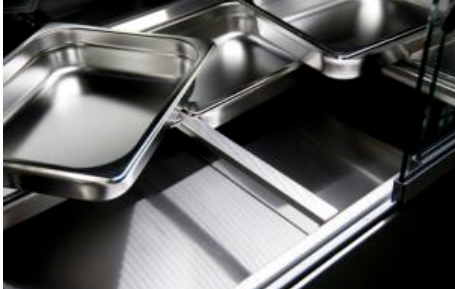
Suits standard GN pans

Woodson provide a matched profile to the hot food displays and sandwich preparation models to provide a seamless line-up in your service area.