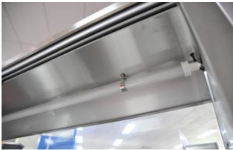
Top mounted fluorescent lighting