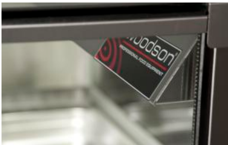
Fully sealed toughened glass for added hygiene