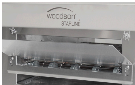
Front loading / exiting