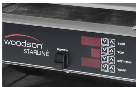
Belt and temperature control

The Bun 25 is Star line's reliable countertop unit, designed especially for toasting hamburger buns. It creates a more accessible and functional workspace for your kitchen.