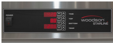
Touch pad "set and forget" control panel