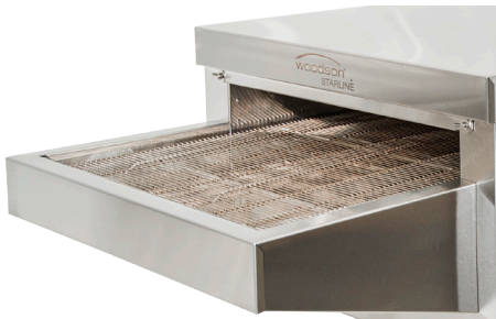
Left and right feed available

The P18 is Starline's smallest pizza conveyor. It provides a robust, user friendly and efficient way of cooking up to approx 38 x 9" pizzas per hour.