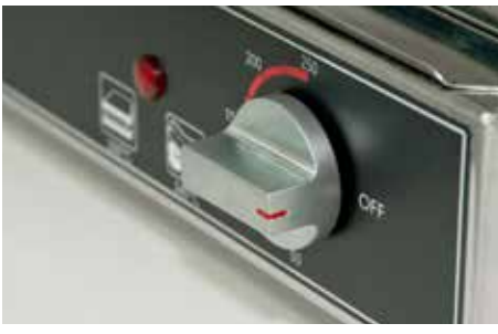
Thermostat control and pilot light

Woodson contact toasters are ideal for focaccia, toasted sandwiches and kebabs.