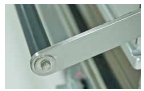
Insulated handle for added safety