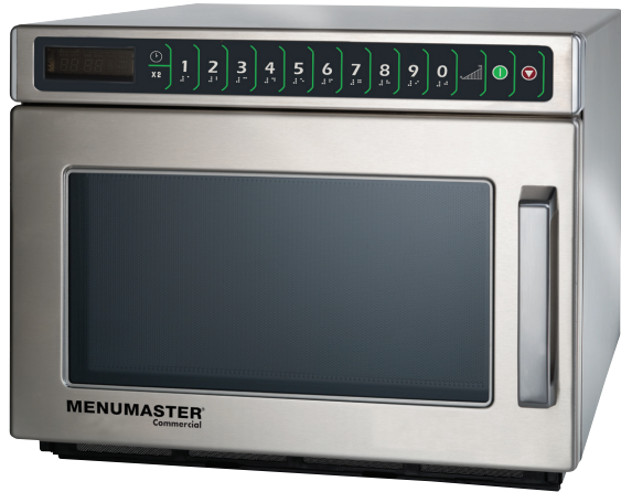
Model DEC14E2 shown