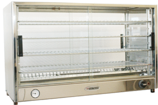
NS4 & NQ4

MR series units are powder coated black as standard. Custom Colours can be made to order.