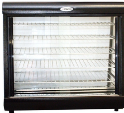
MR2H & MR3H