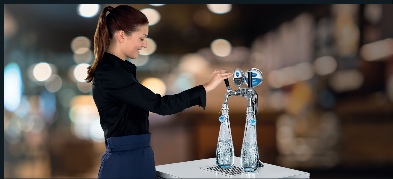
High Volume Bottling System

Every pour supports sustainability wellness and cost saving.