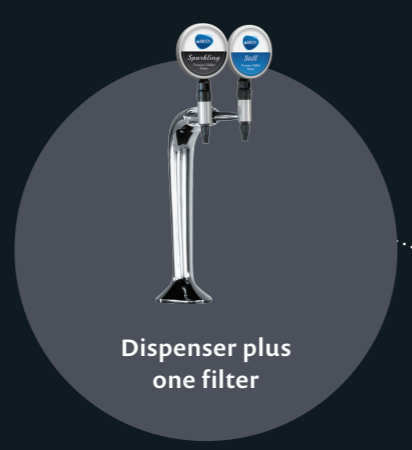
Dispenser plus one filter