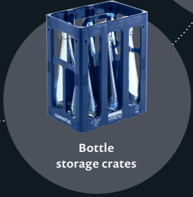
Bottle storage crates