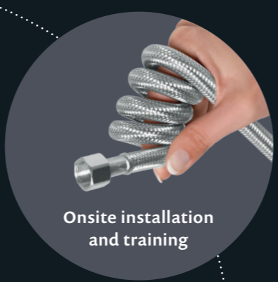
Onsite installation and training