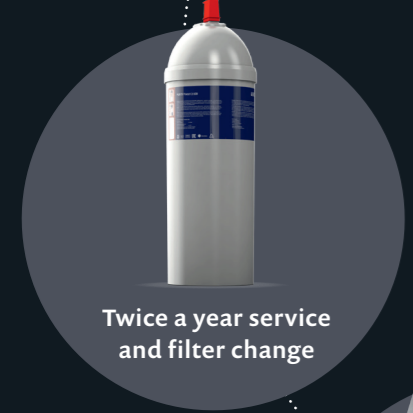
Twice a year service and filter change