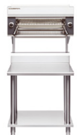
CS9 / C900-S